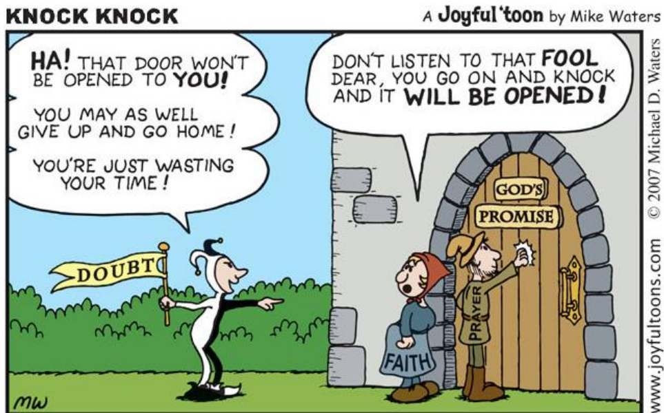
Ask, and it shall be given you; seek, and ye shall find; knock, and it shall be opened unto you: - MATTHEW 7:7 KJV